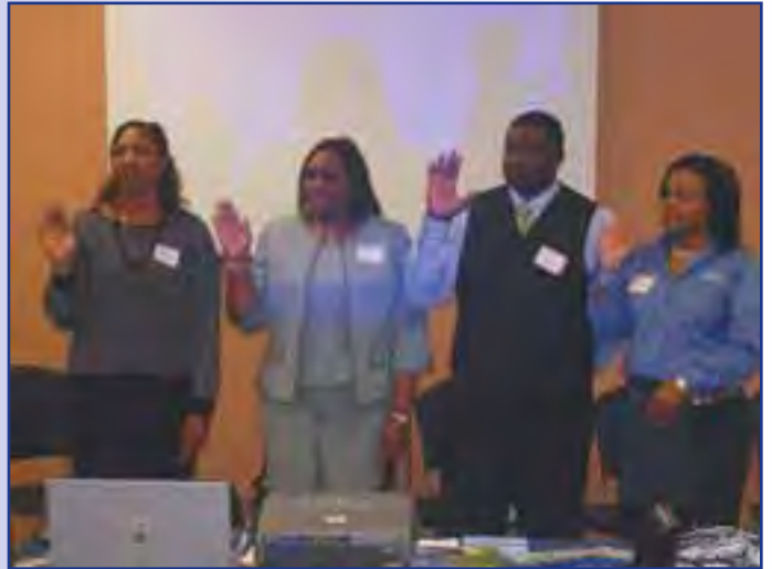
Tuscaloosa Chapter officers take the oath to uphold the mission of the National Alumni Association and the University.