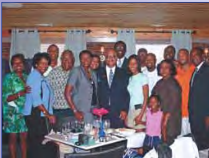
Gary/Northwest Indiana alumni and friends.